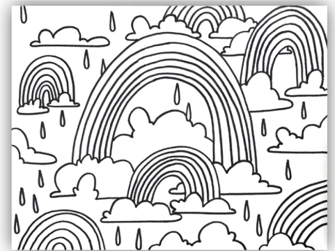
Coloring Page Option