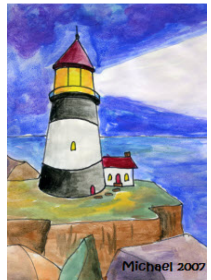
Painted with tempera cake paints