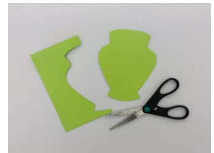
Get started by creating a template for the vase