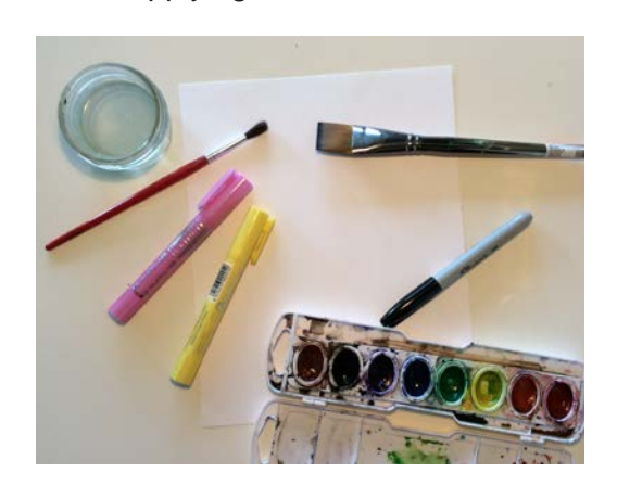
Gather your supplies

Dry Brush: When the paper is dry before applying the watercolor.