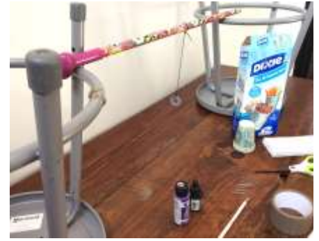
Above: Washer on String