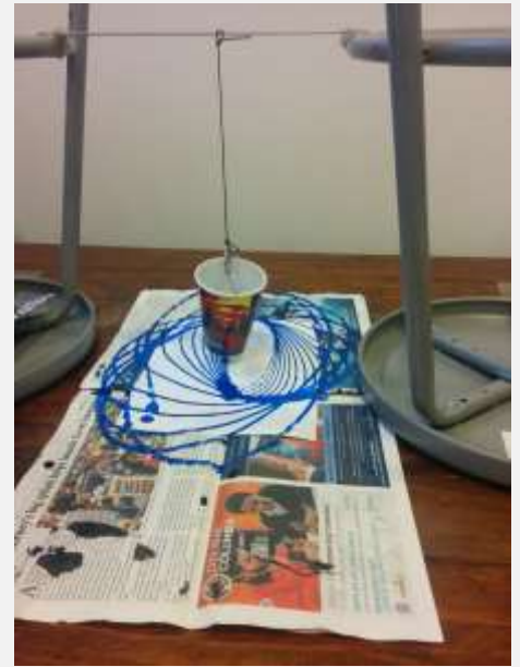
Cup pendulum after swinging